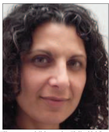
"For some children, the "Mindful Language" is not a privilege, but the air they must breathe in order to live". Simi Levi